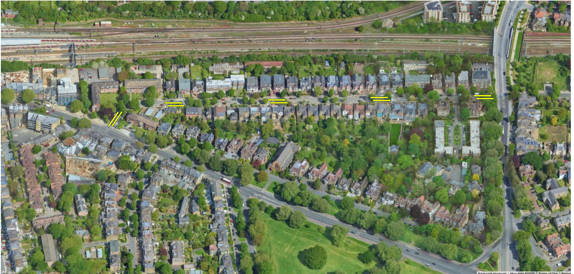
Fig 1 - A4020, Uxbridge Road Two-Way Short Cut/Rat Run via Hamilton Road, Ealing W5 between A4020/A406, North Circular